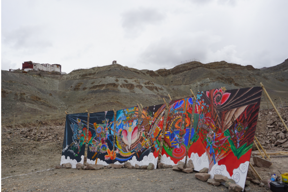
Daisuke Kagawa "Return here again " Forest Art Festival 2023

The Forest Art Festival of 2023 took place in Ladakh, the northernmost region of India, known for its high elevation of 3800 meters. In collaboration with the local community in Matho village, a total of 6000 seedlings were planted on a five-acre land, symbolizing a collective effort towards environmental conservation and community engagement.