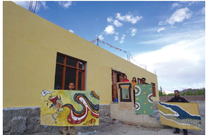
Workshop started in the morning and ended in the evening.