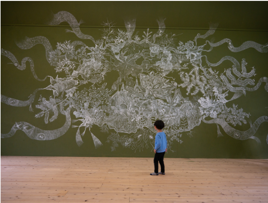
“Emergence of the source” Wall Art Festival Fukushima in Inawashiro 2023

In their artistic endeavors, they skillfully express the myths and stories passed down through generations within the Warli community. Their unique perspective extends beyond traditional themes to encompass the contemporary world. Their grand murals, adorning various locations in India, have garnered acclaim from art enthusiasts. Notably, the Vayeda Brothers have also engaged in residential projects in Japan and held exhibitions across Europe and the United States, including participation in the 10th Asia Pacific Triennial of Contemporary Art (APT10) in Australia.