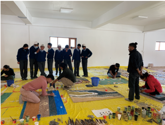
Ladakhi artists in the workshop and students came to see.

Haruna Sugisaki crafted four pieces using mediums derived from soil, ash, and soot. During a workshop attended by ten Ladakhi artists, she not only showcased the method of creating and utilizing these mediums but also engaged in hands-on practice on canvas. The completed artworks were later exhibited in the plantation field during the Forest Art Festival in 2023 (FAF 2023).