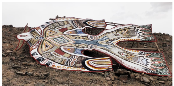
One of the works by Haruna Sugisaki "Flying Human" W 500 cm by H 120cm