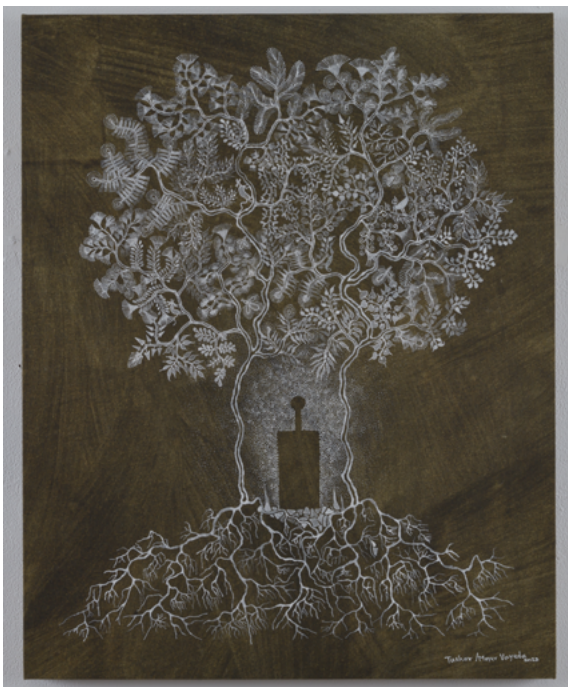
Veer -Statue of Ancestors 2023